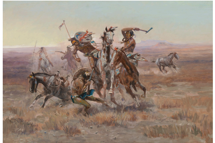
When Blackfeet and Sioux Meet , 1908, C. Russell